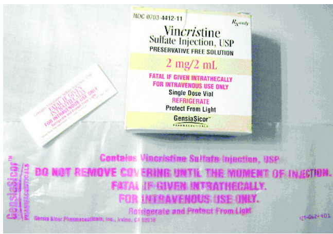
Figure 4. Example of Vincristine Box Label, Syringe Label, and Plastic Overwrap

by appropriately trained staff. Intrathecal and IV chemotherapy should never be dispensed or delivered together. When a patient is scheduled to receive intrathecal and IV chemotherapy treatment, the treatment should be viewed as two distinct procedures that are to be performed at different points in time. At least two clinicians should independently verify intrathecal medications prior to their administration. Intrathecal chemotherapy should be given in designated locations only, and, ideally, the pharmacy staff should deliver intrathecal chemotherapy immediately before use. Prepared intrathecal chemotherapy never should be stored or placed on a counter on a patient care unit or in a patient's room (Dyer, 2001; ISMP, 2003; Root & the British Oncology Pharmacy Association, 2001). In addition, Laws (2001) suggested that medical product manufacturers should develop syringes and equipment for epidural use that are noninterchangeable with IV products.