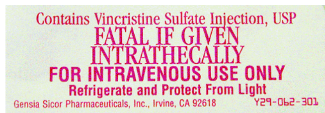
Figure 3. Example of Syringe Label That Is Affixed to Prepared Doses of Vincristine

In developing an institutional policy for intrathecal chemotherapy administration, several concepts warrant inclusion. First, chemotherapy of any kind should be given only