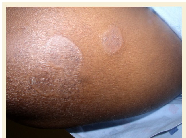
FIGURE 4. Case Study 4 Patient

In July 2011, the patient was diagnosed with MF-CTCL stage Ib (T2N0M0B0); a skin punch biopsy from a patch on her