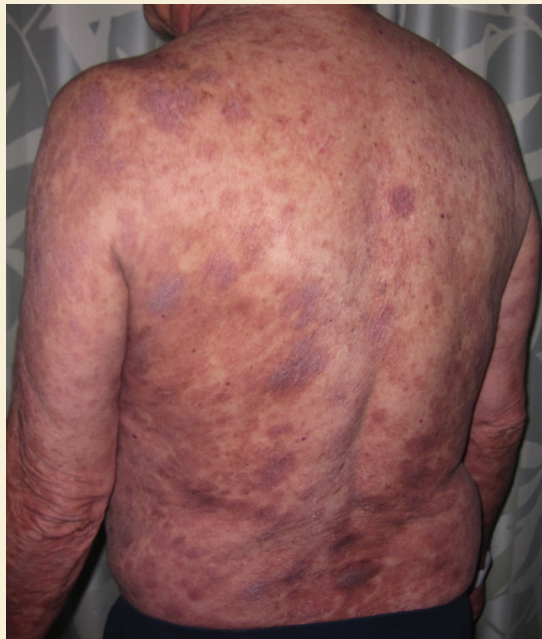
FIGURE 3. Case Study 3 Patient

Note. Photographs courtesy of Dana-Farber/Brigham and Women's Cancer Center. Used with permission.