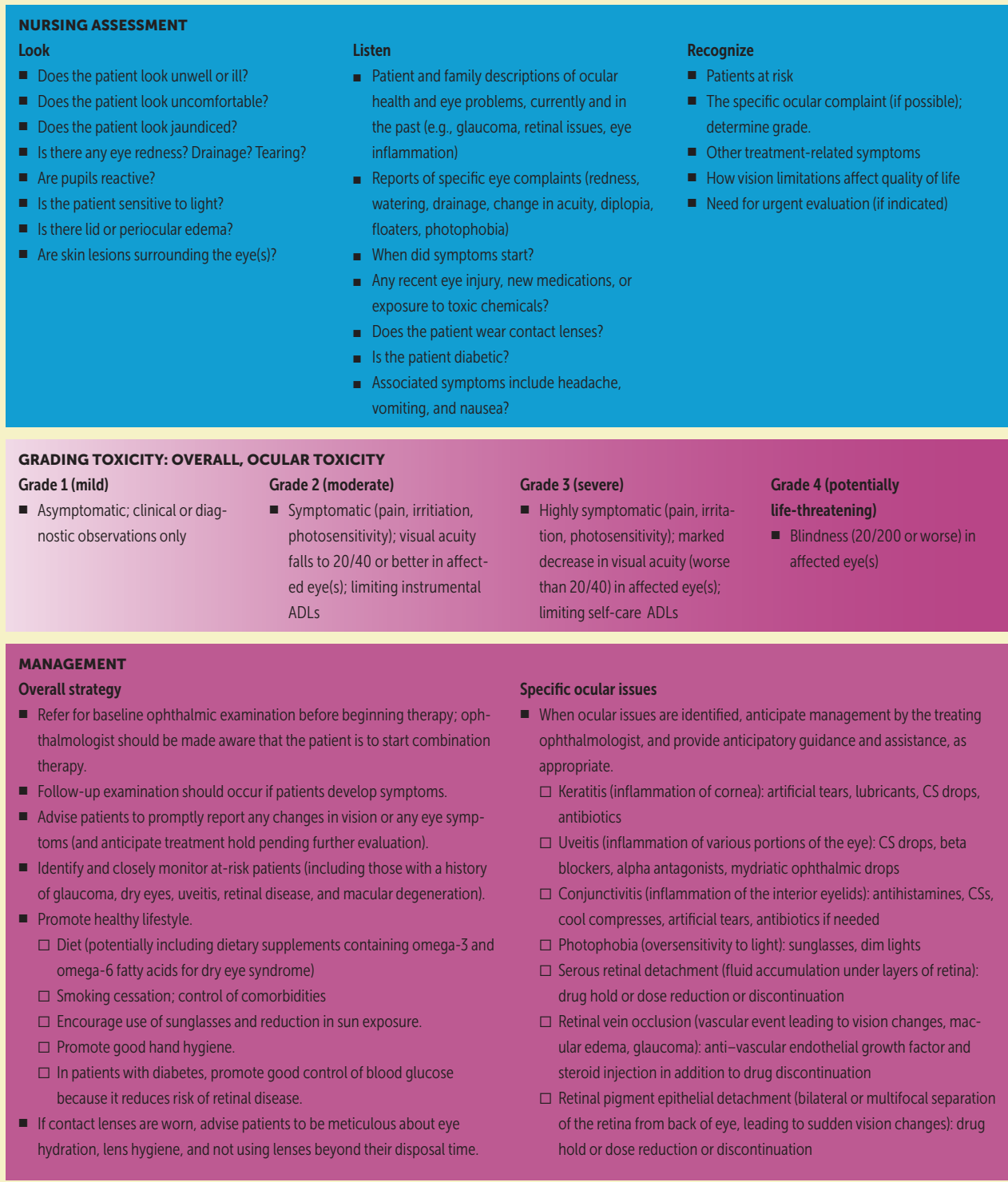
FIGURE 4. CARE STEP PATHWAY FOR MANAGEMENT OF OCULAR TOXICITY

Downloaded on 07-04-2024. Single-user license only. Copyright 2024 by the Oncology Nursing Society. For permission to post online, reprint, adapt, or reuse, please email pubpermissions@ons.org. ONS reserves all rights.