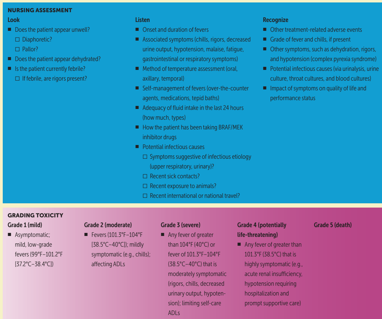
FIGURE 2. CARE STEP PATHWAY FOR MANAGEMENT OF PYREXIA: ELEVATED BODY TEMPERATURE IN THE ABSENCE OF CLINICAL OR MICROBIOLOGIC EVIDENCE OF INFECTION

ADLs—activities of daily living; BRAF—v-Raf murine sarcoma viral oncogene homolog B; MEK—mitogen-activated protein kinase kinase Note. Based on information from Atkinson et al., 2016; Genentech 2016, 2017; Lee et al., 2014; Menzies et al., 2015; National Cancer Institute, 2010; Novartis, 2016, 2017a. Note. Copyright 2017 by Melanoma Nursing Initiative. Used with permission.