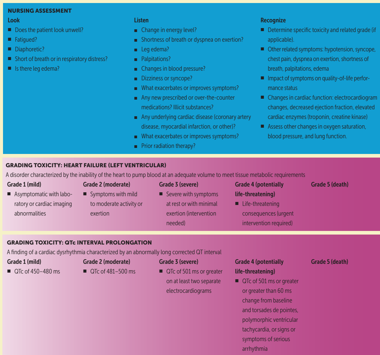
FIGURE 5. CARE STEP PATHWAY FOR MANAGEMENT OF CARDIOTOXICITY

management by establishing connections with referral clinicians to care for more challenging or serious AEs and to ensure optimal AE management and prevention of more serious sequelae.